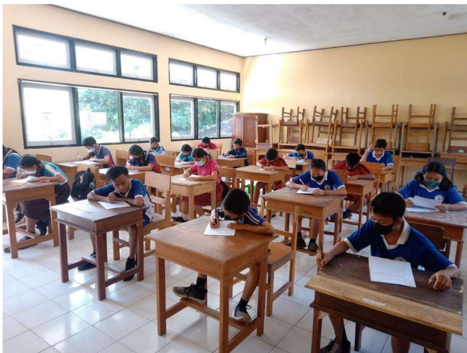
PICTURE 4. The Interview Session with The Student