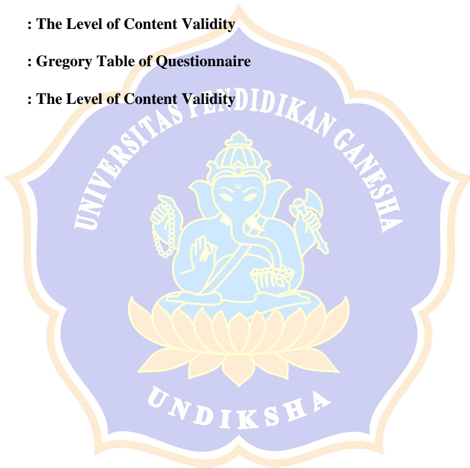
Table 3.6 : The Level of Content Validity

Table 3.5 : Gregory Table of Questionnaire