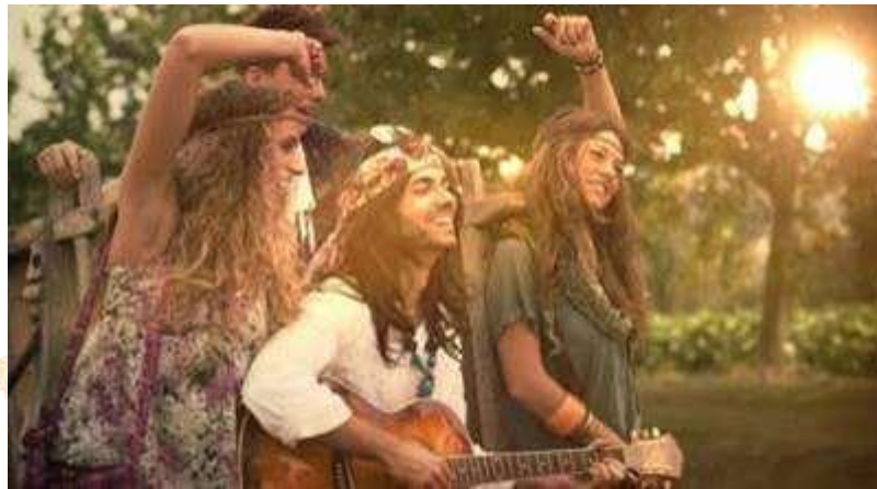
The Hipsters

What is in your mind when you heard about Indie? Indie in the society also known as Hipster, a designation for some people in an area, who has a music taste, art, fashion, and soul which seen different than its society. They are the "unique", "artsy", and the "anti-mainstream". Some articles also said that Indie people usually made some arts, whether it is paintings or other visual arts, songs, poetry or other kinds of writings. Indie becomes the "hype" in Indonesian teenagers nowadays.