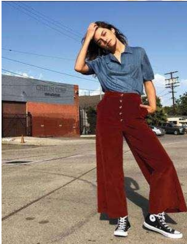
70s outfit combination as an indie fashionable choice

First, the look. To become indie, you should wear whatever that makes you comfortable and confident. Branded outfit and glamorous accessories are not necessary. You can make DIY outfit out from your old clothes or even make your own accessories. You can decorate or customize your old clothes and make them look brand new and unique. That is also for the footwear. You can use anything fits you. wikiHow told that Indie is about appreciating what is "good", and good is timeless. Thus, indie people are appreciating vintage. If your parents still keep their teenager outfit from 70s, you like it, and it comforts you, feel free to wear it. If people told you that becoming indie you should wear this and that you should not believe them, because becoming indie, you have no rules.