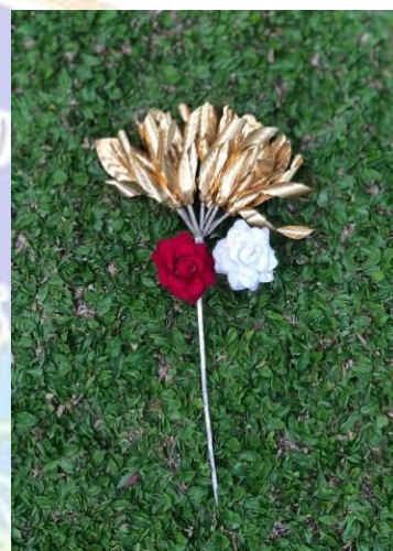
Figure 4.25 bunga mas and bunga kuping