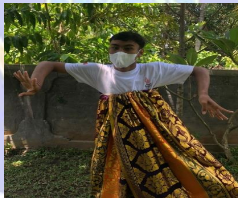
Figure 4.6 sogok