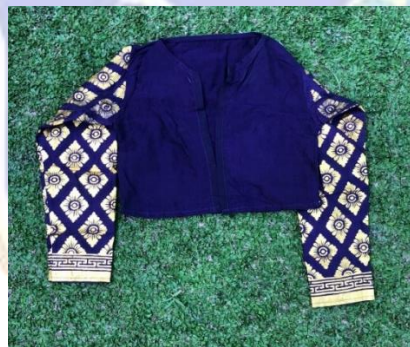
Figure 4.32 baju