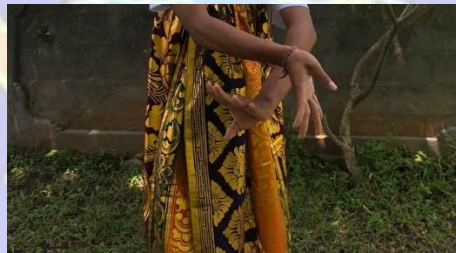
Figure 4.14 nyilang tangan