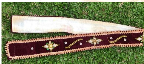
Figure 4.34 tutup dada