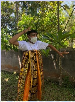
Figure 4.8 nabdab gelung