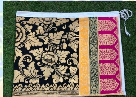
Figure 4.33 saput