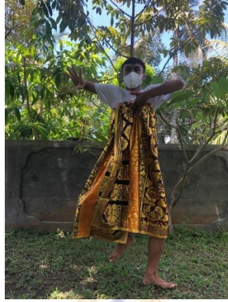
Figure 4.18 malpal