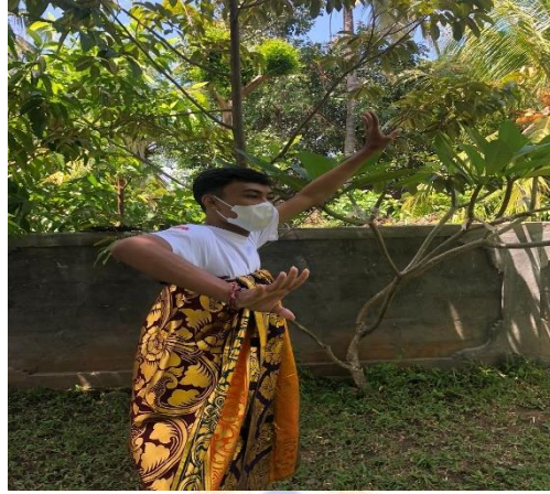
Figure 4.10 ngalih pajeng