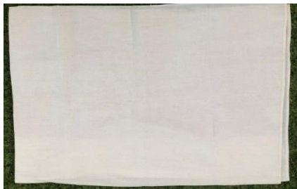
Figure 4.30 kamen