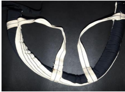
Figure 4.28 semayut