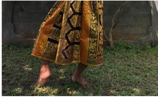
Figure 4.21 piles