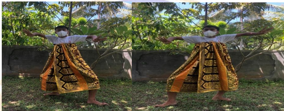
Figure 4.5 agem kanan and agem kiri