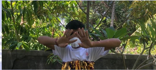
Figure 4.13 jeriring