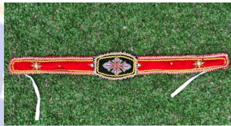
Figure 4.31 pending