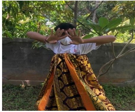
Figure 4.4 mungkah lawing