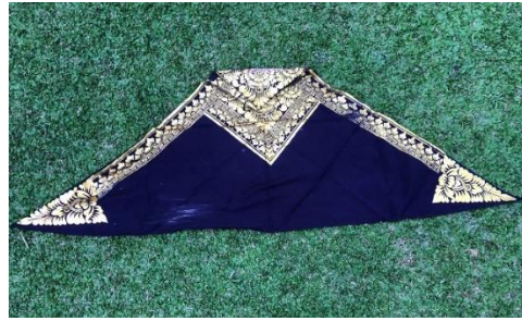
Figure 4.23 udeng lembaran