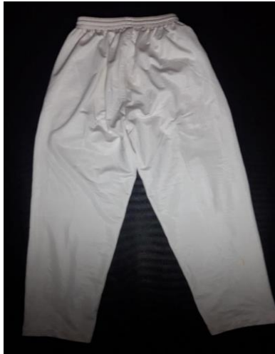
Figure 4.36 celana