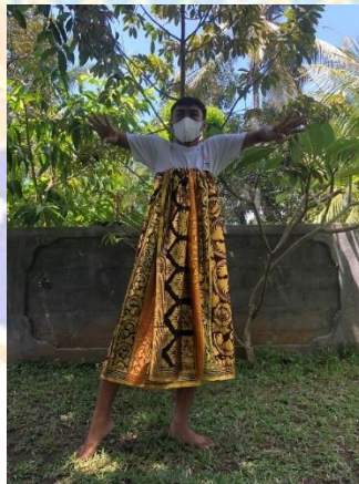
Figure 4.20 nanjek