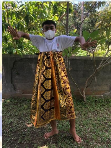
Figure 4.17 ngerejat