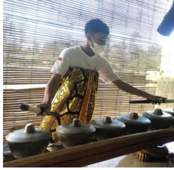
Figure 4.15 ngambelang terompong