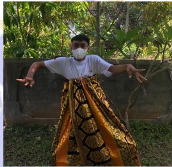
Figure 4.16 ngoyod