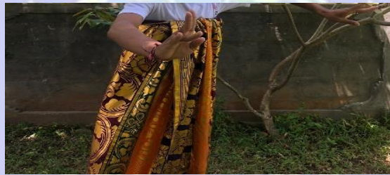
Figure 4.9 nuding