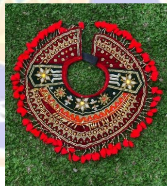
Figure 4.27 badong