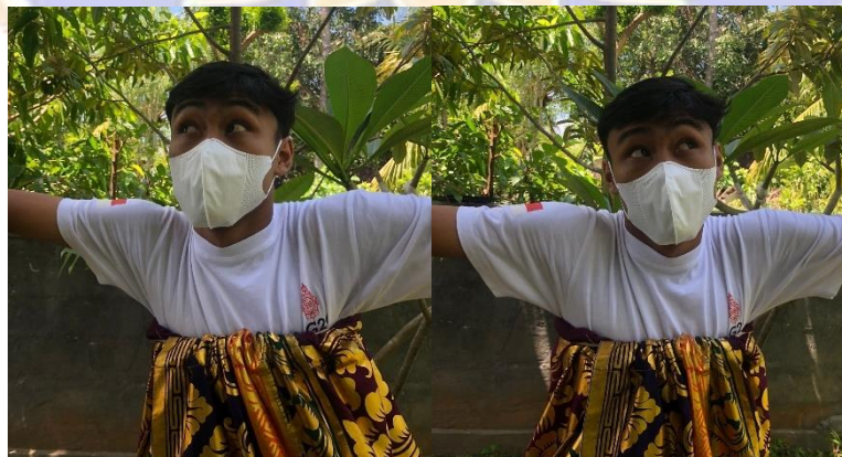
Figure 4.3 nyeledet