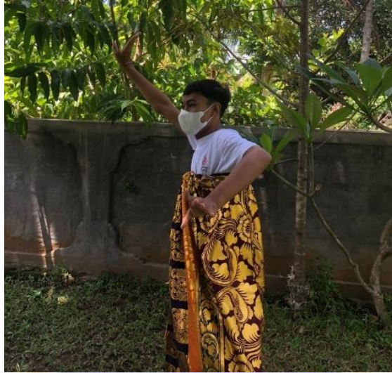
Figure 4.12 ngupak lantang