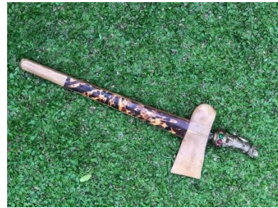
Figure 4.29 danganan