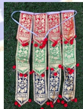
Figure 4.35 angkep