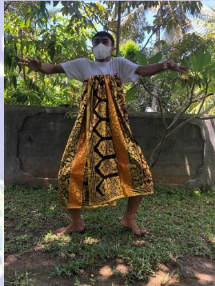
Figure 4.19 nayog