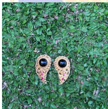
Figure 4.26 rumbing