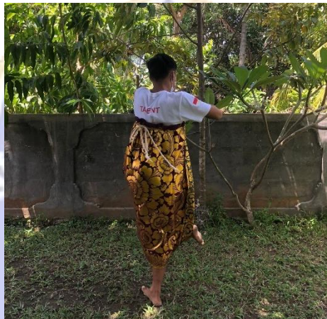
Figure 4.22 melingser