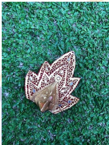
Figure 4.24 geruda mungkur