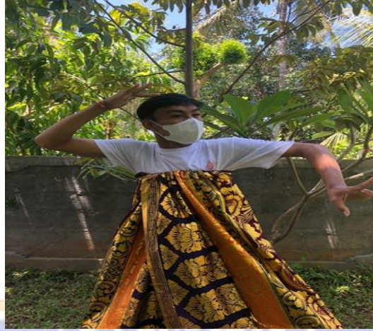
Figure 4.1 kipek