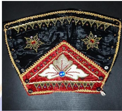
Figure 4.37 stewel