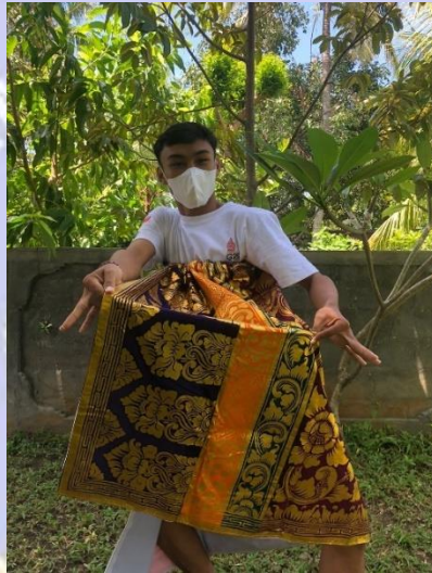
Figure 4.11 nyambir saput