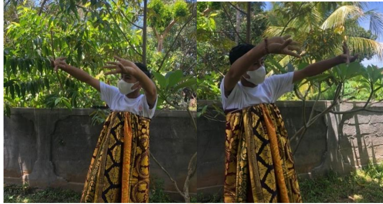
Figure 4.7 ulap-ulap