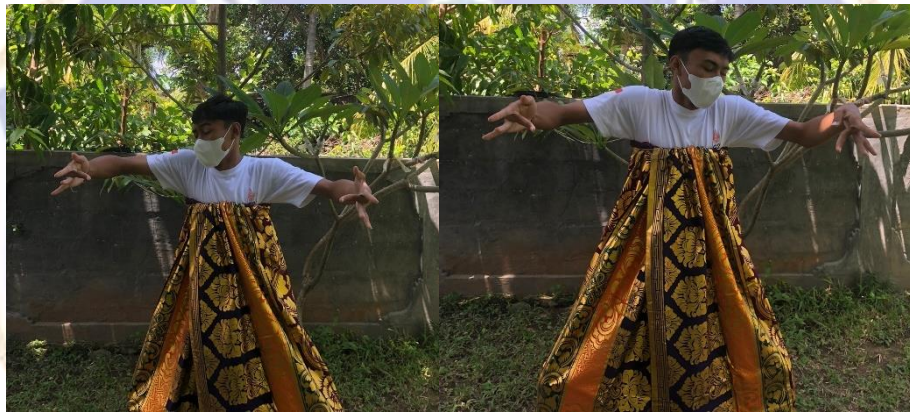
Figure 4.2 ngelier