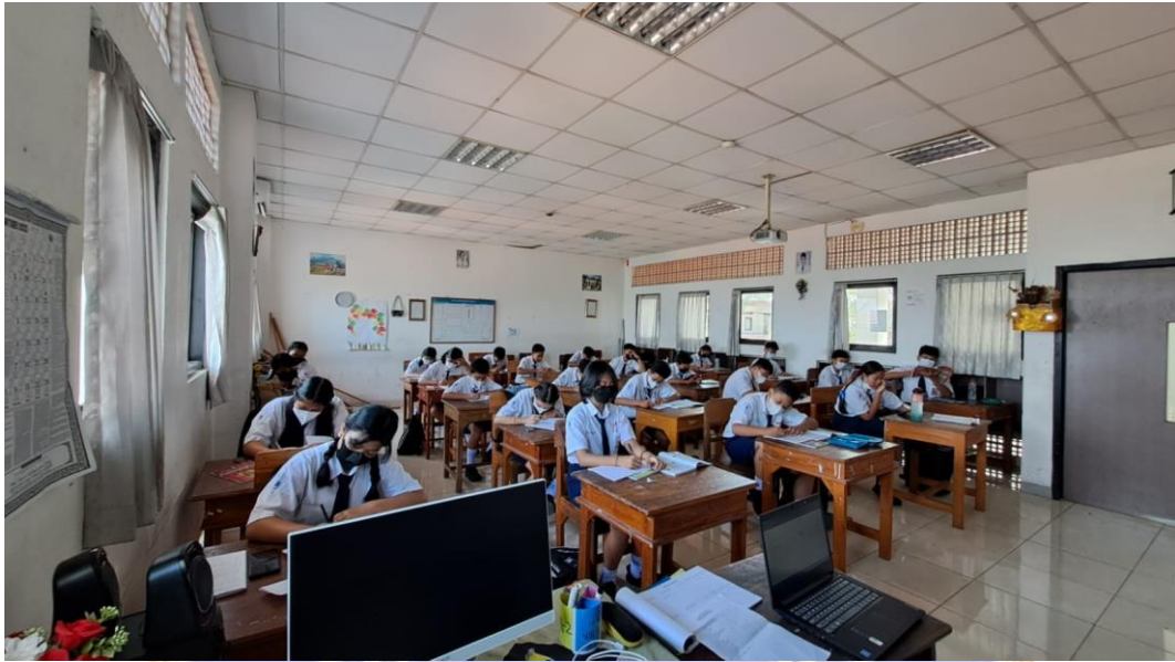
Documentation 1. Students were writing recount text.