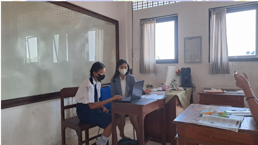
Documentation 2. Student interviewed.