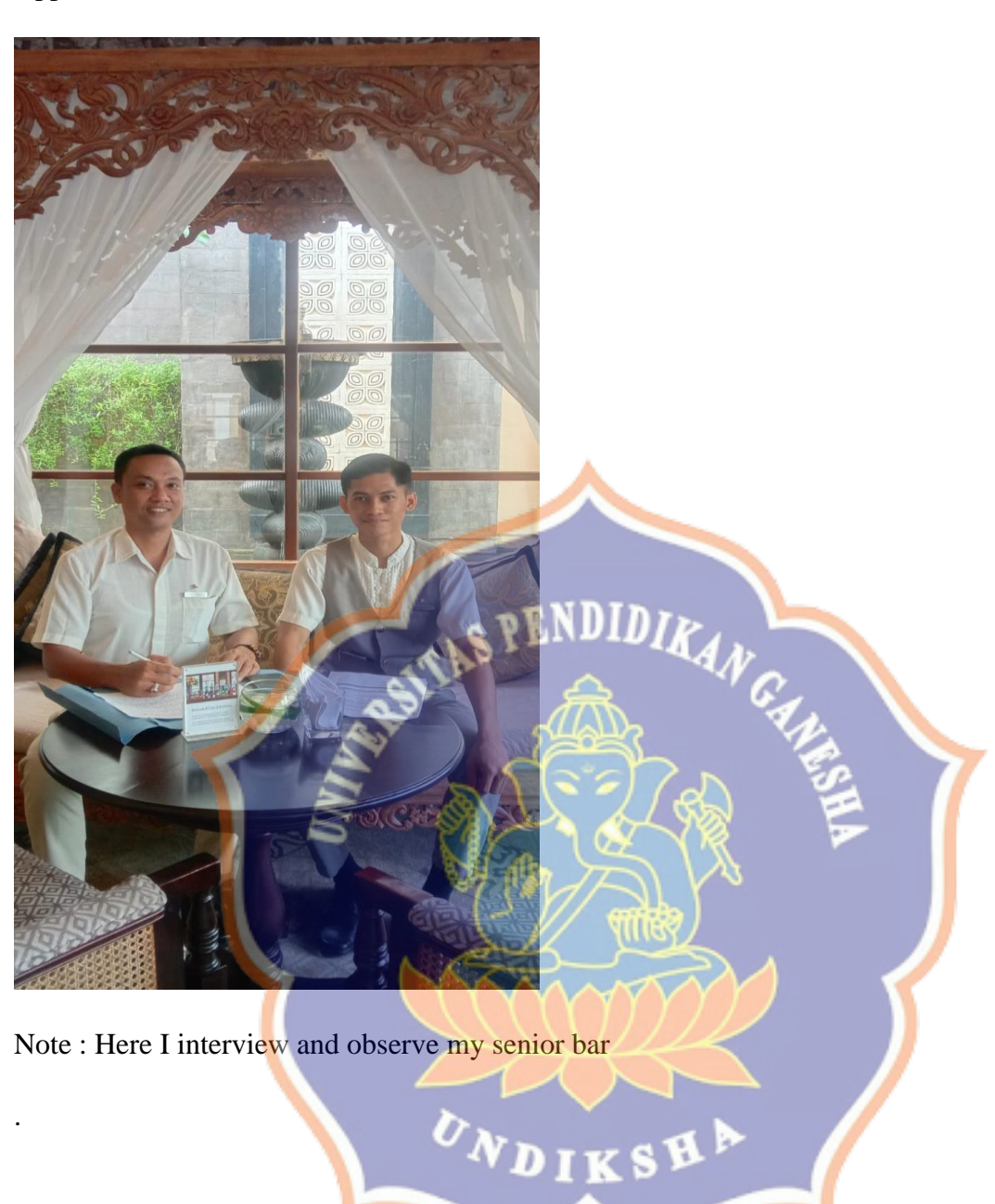
Appendix 3 Obeservation and Interview