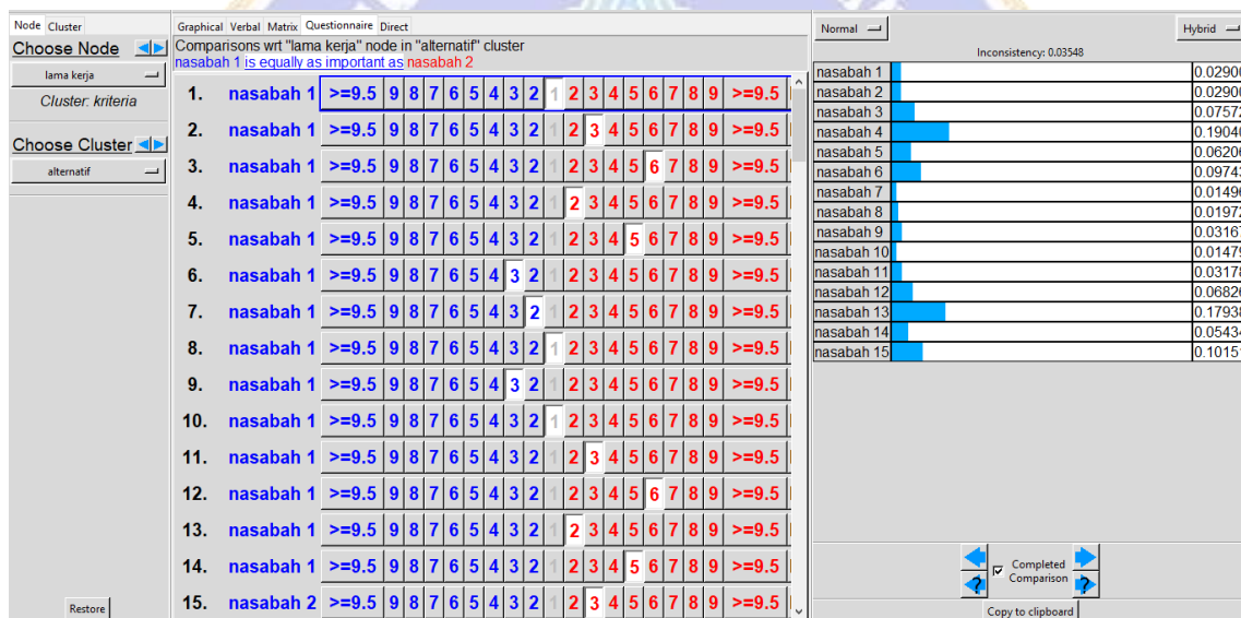
L 18. Lama Kerja Terhadap Alternatif