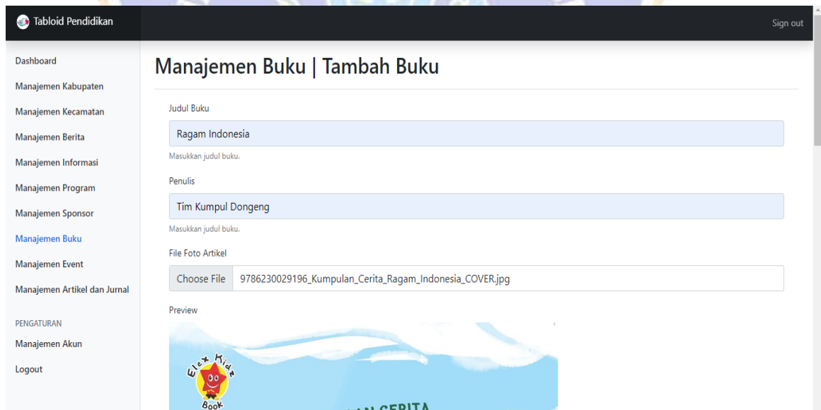
Gambar 27 Uji coba Input buku