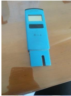
Alat Ukur TDS (Gambar 3.4)