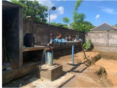
Sumur Bor Gang Salak (Gambar 3.2)