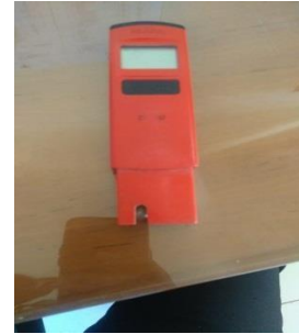
Alat Ukur pH (Gambar 3.3)