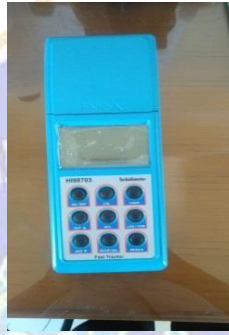
Alat Pengukur Kekeruhan (Gambar 3.6)