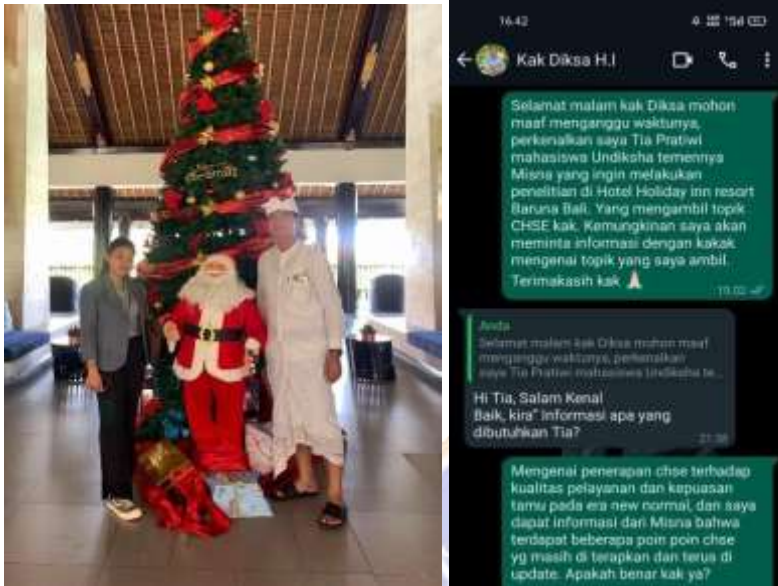
Kegiatan Observasi bersama Learning & development Hotel Holiday Inn resort baruna Bali