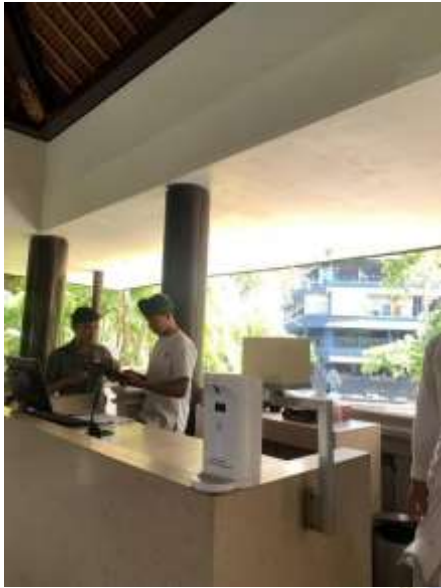
Lampiran 2: Foto Penerapan CHSE Di Hotel Holiday Inn Baruna Bali