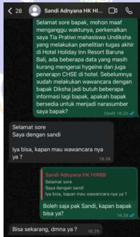
kegiatan wawancara bersama supervisor housekeeping