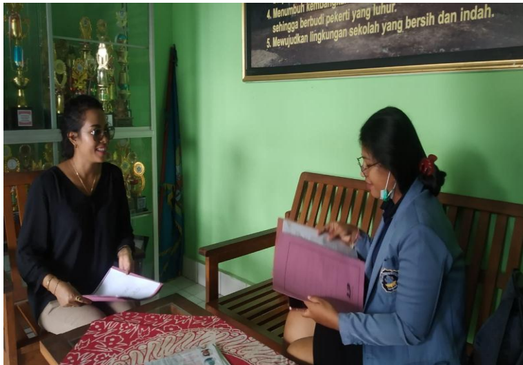
SMP N 1 PENEDEL