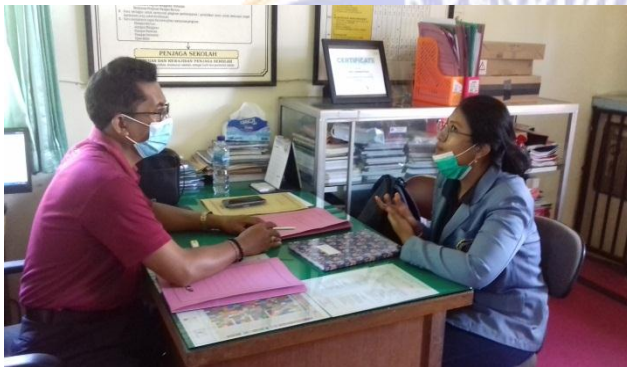
SMP N 2 SELEMADEG TIMUR