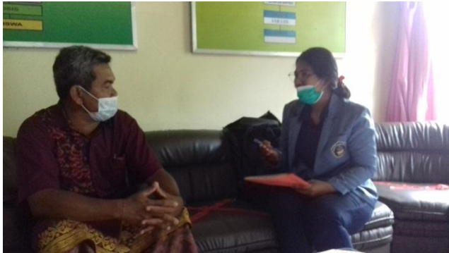
SMP N 1 SELEMADEG TIMUR