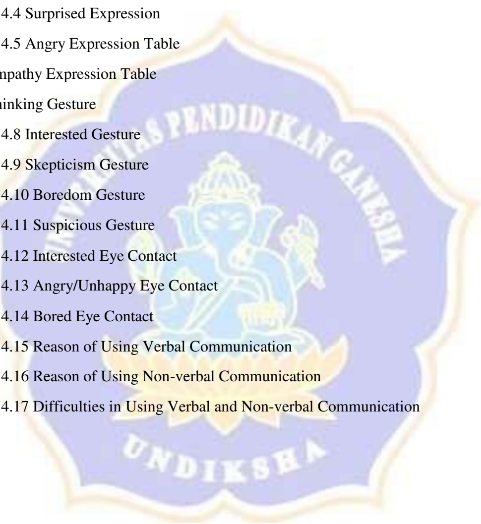
Table 4.17 Difficulties in Using Verbal and Non-verbal Communication

Table 4.16 Reason of Using Non-verbal Communication