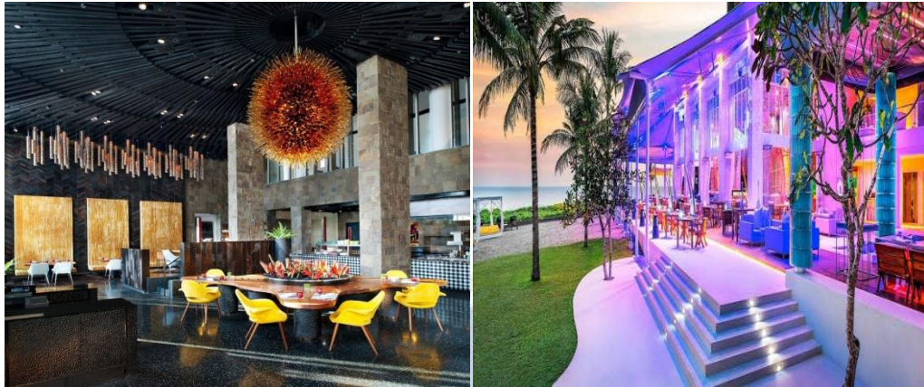
Fire Restaurant (W Bali – Seminyak) Starfish Bloo Restaurt (W Bali – Seminyak)